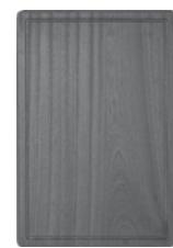
ECB1810 Cutting Board